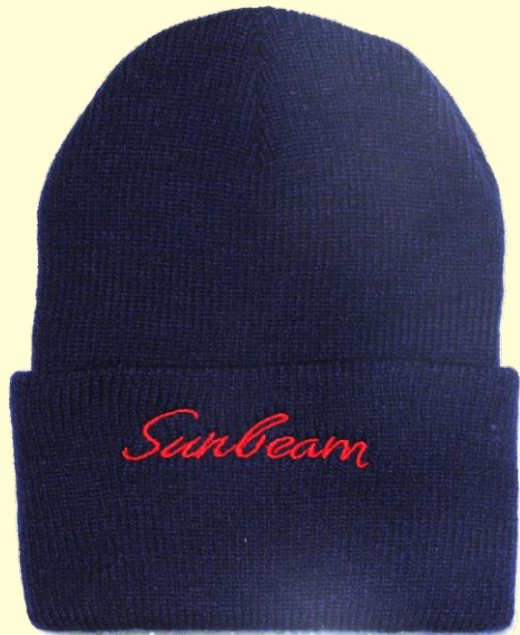
Cap (Nursery to Class XII)