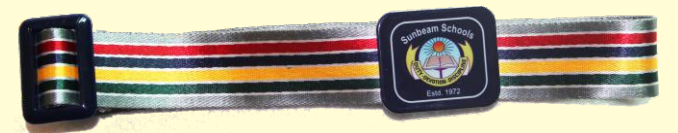
Belt (classes VI - XII)

NOTE Parents are free to buy Uniform / Accessories / Shoes from any shop / outlet of their convenience from anywhere in the city.