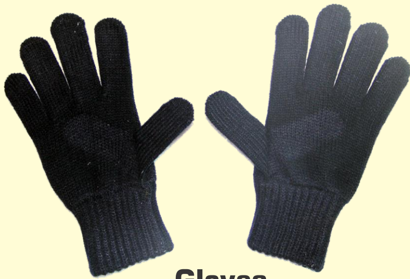
Gloves (Nursery - class XII)