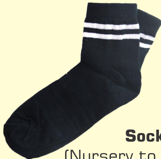
Socks (Nursery to Class XII)